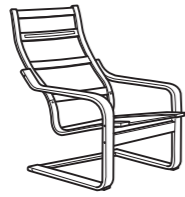
扶手椅椅框備有樺木、棕黑色及褐色。 Armchair frame available in birch, black-brown and brown.

The frames come in different types of wood and with different finishes.