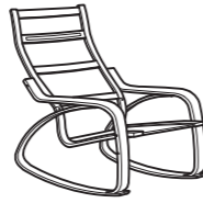
搖椅椅框備有樺木、棕黑色及褐色。 Rocking chair frame available in birch, black-brown and brown.