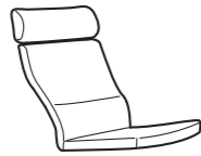
椅墊設計 配以HILLARED、LYSED布套及GLOSE、SMIDIG皮套。 Cushion design with HILLARED, LYSED fabric covers and GLOSE and SMIDIG leather covers.

The cushions come with covers in different designs, materials and colours. Combine the way you want.