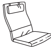
椅墊設計 配以VISLANDA布套。 Cushion design with VISLANDA fabric covers.